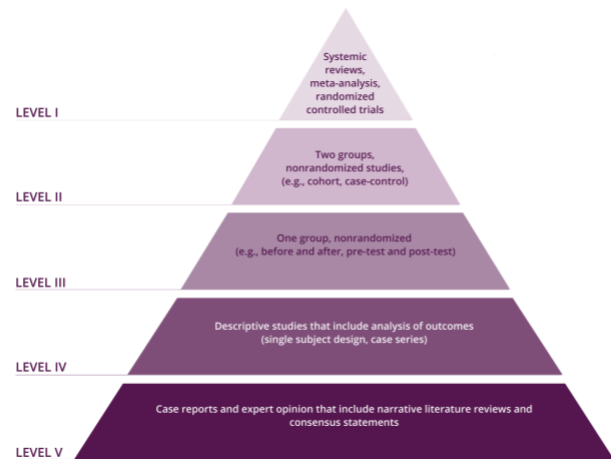
Figure 2. Adapted from "Pyramid of Evidence." 1996. Rutgers University Libraries . Retrieved August 24, 2020, from https://libguides.rutgers.edu/c.php?g=524495&p=3586302 .