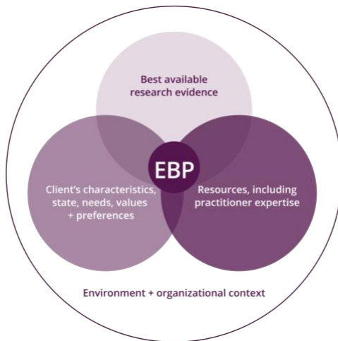
Figure 1. Adapted from "Evidence-Based Social Work Practice." 2012. Simmons University Online . Retrieved August 24, 2020, from https://simmons.libguides.com/EBSW .